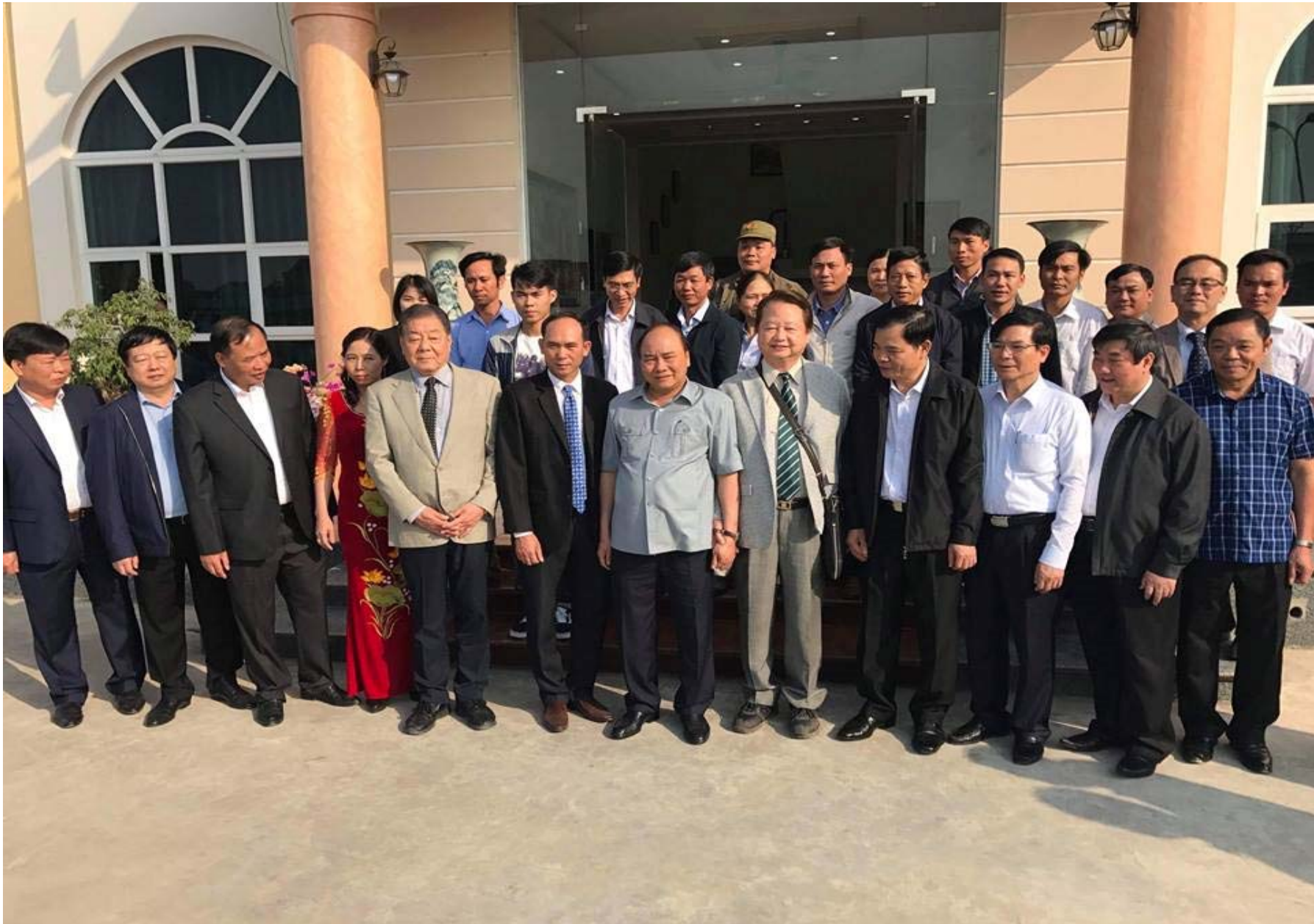
Greeting to Mr. Phuc the Prime Minister of Vietnam at Hung Viet Inc. in April 9, 2018